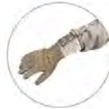
Equipotential bonding leads* between jacket and gloves