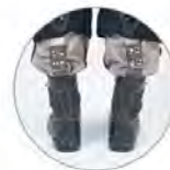
Equipotential bonding leads* between bib-and-brace and boots or socks