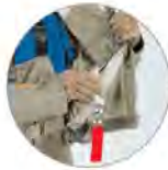
Equipotential bonding leads* between jacket and bib-and-brace or trousers