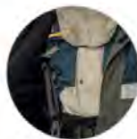
Equipotential bonding leads between conductive coverall and arc protective upper jacket.