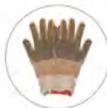
Summer and winter conductive gloves