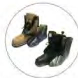
Winter boots made of leather or felt, with fur or in-socks