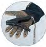
Equipotential bonding leads with clamps