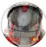
Conductive shielding face mesh